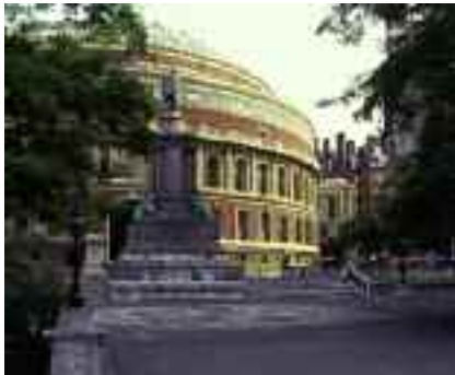
at the 5 star luxurious Grosvenor House Hotel.

The Crowne Plaza Hotel is a traditional deluxe four star hotel close to Buckingham Palace offering supremely comfortable accommodation and excellent service. All bedrooms each have its own individual style and charm and have hairdryer and trouser press. The hotel has three restaurants a spa and gym and a beautiful award winning courtyard garden, surrounded by Victorian buildings.